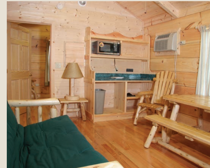
Camper Cabin Interior

Missouri state parks have featured camper cabins for more than 15 years. Camper cabins provide a low cost overnight opportunity for visitors that want to experience state parks, but might not own camping equipment, and are a very popular choice among families. The occupancy for camper cabins is consistently high around the state, demand exceeding availability. The camper cabins are placed on existing campsites and guests utilize the campground restroom and showerhouse facilities.